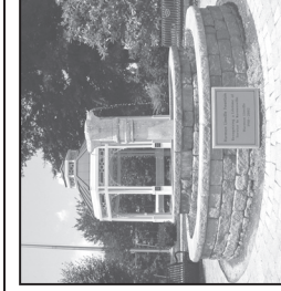
Harmon Park gazebo and fountain

Kernersville News The heartbeat of Kernersville for 70 years